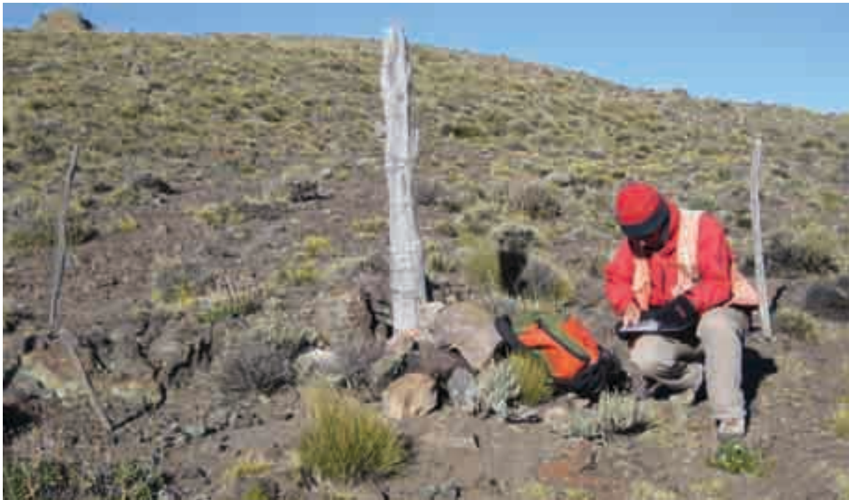
Geologist Salvador Broens at the Fenceline Prospect, Gastre

300 metres south east of Copper Hill at the base of the Canadon Asfalto sequence, (host to the Navidad deposit), rock chip samples have reported results of >3 per cent. copper and 71g/t silver as disseminated mineralisation at the Fenceline Prospect. In addition previous prospecting in an area adjacent to this copper rich trend returned values of up to 5.1g/t gold and 52g/t silver.