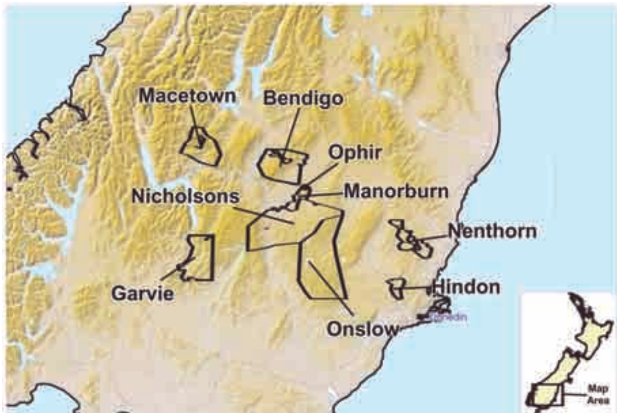
HPD New Zealand property holding in the Otago area of South Island

The Nenthorn Permits are adjacent to the Macraes gold mine Operated by Oceana Gold, which since commissioning in 1990 has produced 1.7 million ozs of gold.