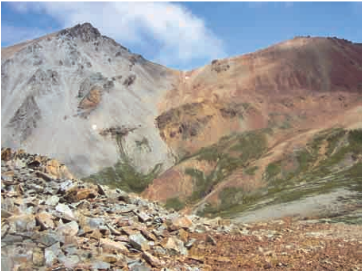
The main peak of Cerro Colorado showing intense alteration

The tenor of these results continues to maintain this prospect's importance. The mineralised system is postulated to have a stratigraphic control being fed by NE striking structures. A report on all available information both recent and historic is being collated to assist in planning further infill sampling and detailed mapping prior to drill programme preparation.