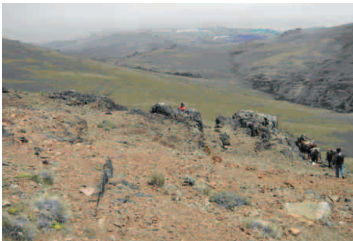
Exploration by horse from tented camps in Carrenleufu

Carrenleufu Block: This block of six cateos, covering 600 square kilometres, is located in the Andean cordillera along the border with Chile in south western Chubut. A stream sediment survey including panned concentration of streambed material and large sediment samples for BLEG analysis over this remote area was completed early in the season. The results from this first pass drainage sampling survey included several panned concentrate samples with values up to 6g/t gold as well as anomalous BLEG samples in different drainages.